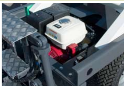
Petrol engine (option)