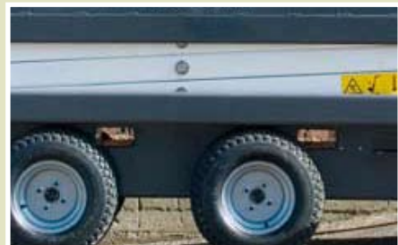
Frame holes for forklift transport