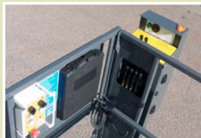
Easy to operate