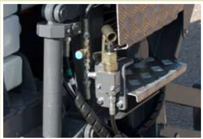
Hand pump for service use