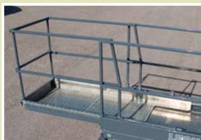
Platform extension 1,2 m (option)